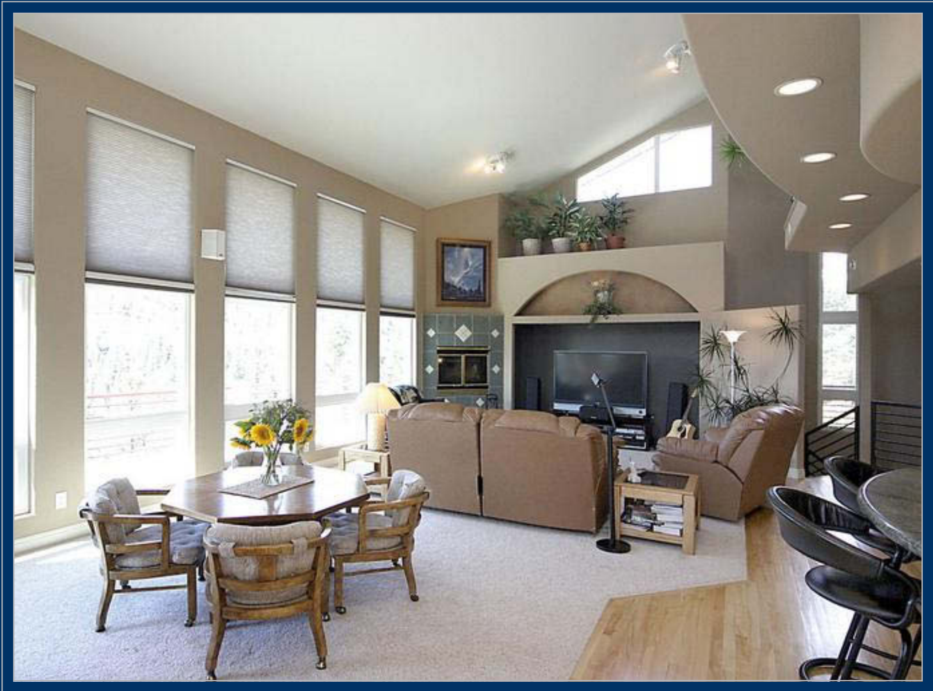
ALL ROOMS DESIGNED TO INCORPORATE VIEWS