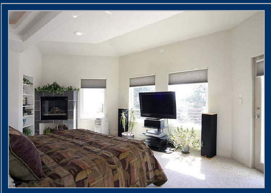
PRIVATE DECK * HIS & HER CLOSETS * VIEW