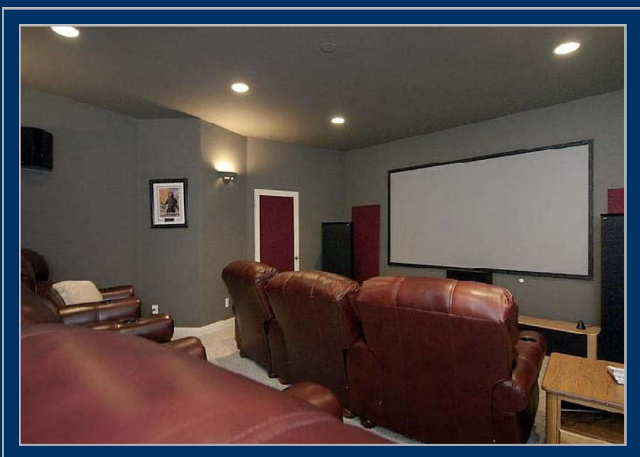
ALL INCLUSIVE HOME THEATRE / MEDIA ROOM