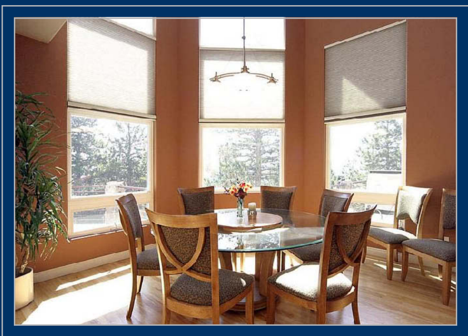
FORMAL DINING * LOTS OF WINDOWS * VIEW