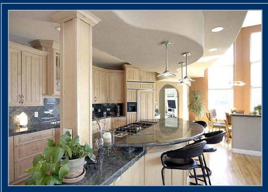
QUALITY THROUGHOUT * BIRCH FLOOR